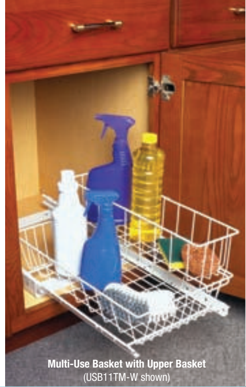
Multi-Use Basket with Upper Basket (USB11TM-W shown)