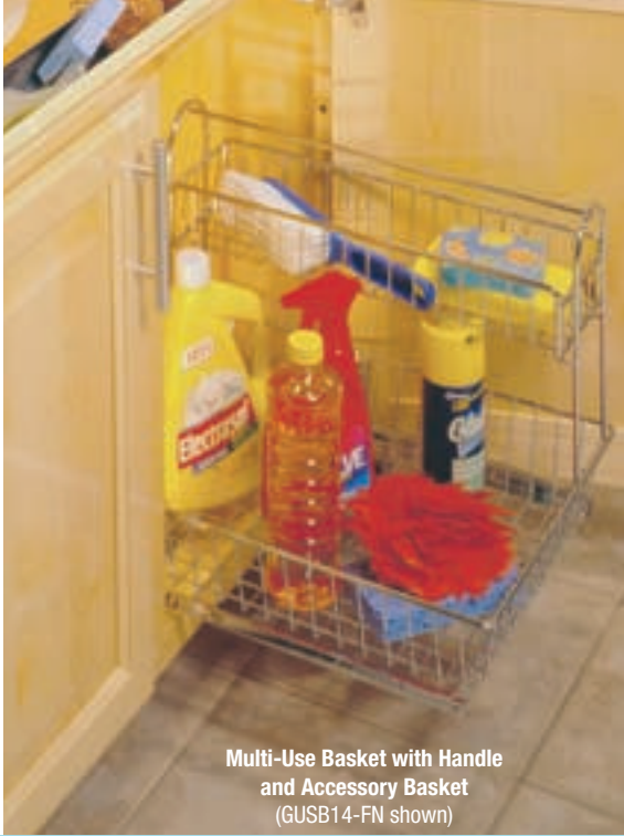
Multi-Use Basket with Handle and Accessory Basket (GUSB14-FN shown)