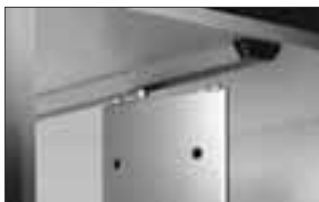
Height Adjustment up to 85 mm (3 3/8")

The cabinet bottom needs to be secured below the runner against sagging.