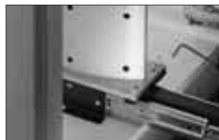
Fast and easy assembly also for installation at a later time.