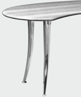
Table Legs - Tapered