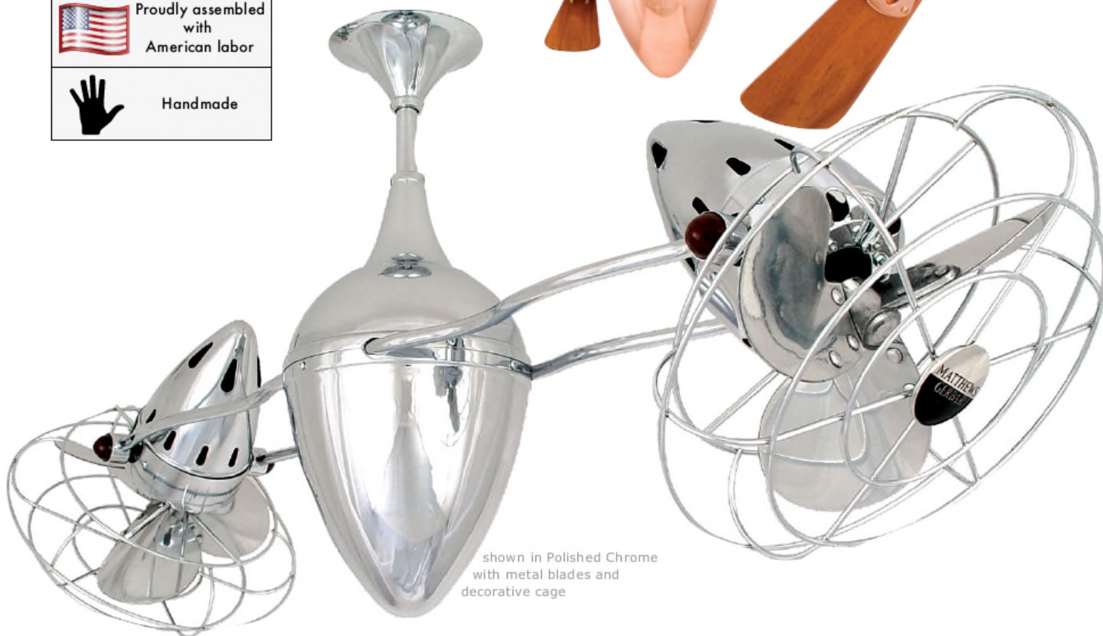
shown in Polished Chrome with metal blades and decorative cage

The Ar Ruthiane's unique hourglass support arms grasp bullet-shaped motor housings which rotate 360° about its teardrop center. The fan heads can be infinitely positioned in 180-degree arcs for optimum air movement; the greater the angles of the motors to the horizontal support rods (up or down), the faster the axial rotation. A slow, controlled axial rotation is achieved by both fan head position and fan blade speed. Matthews 360° rotational fans circulate heat and air conditioning more efficiently than traditional paddle fans. Constructed of cast aluminum, heavy spun and stamped steel, the Ar Ruthiane carries a limited lifetime warranty.