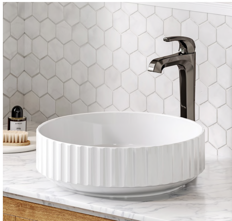
Viva™ Porcelain Ceramic Vessel Bathroom Sink (KCV-201GWH)