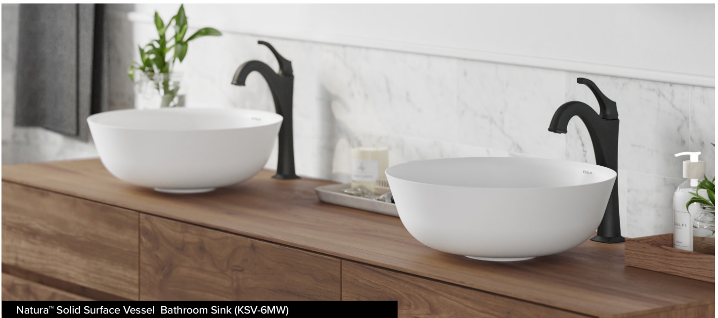
Natura™ Solid Surface Vessel Bathroom Sink (KSV-6MW)