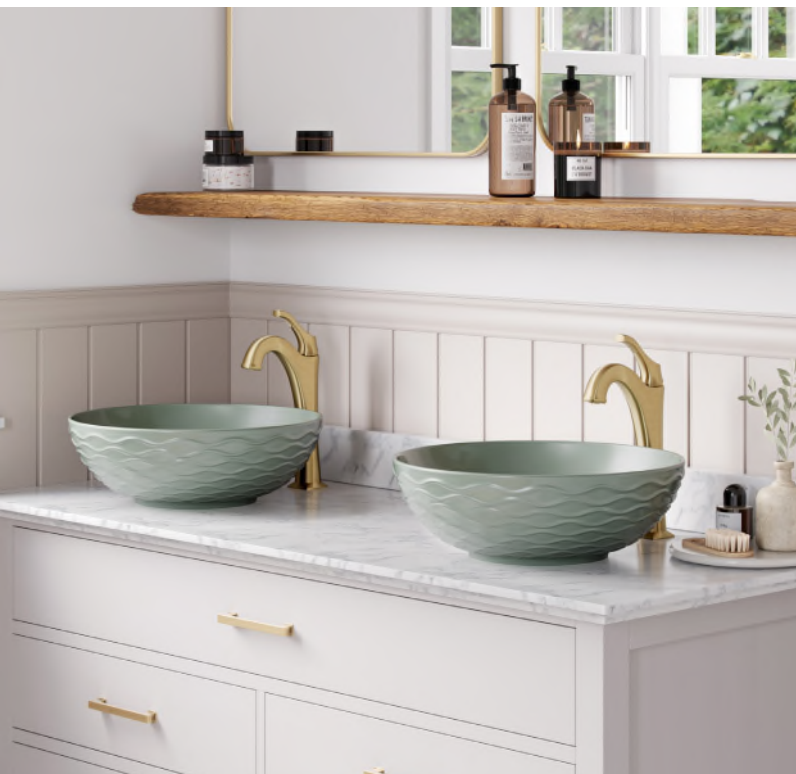
Viva™ Porcelain Ceramic Vessel Bathroom Sink (KCV-200GGR)