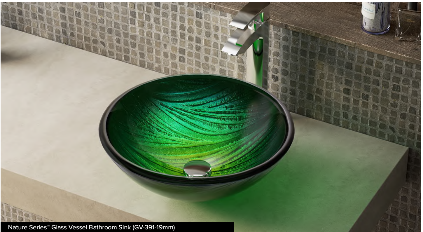
Nature Series™ Glass Vessel Bathroom Sink (GV-391-19mm)