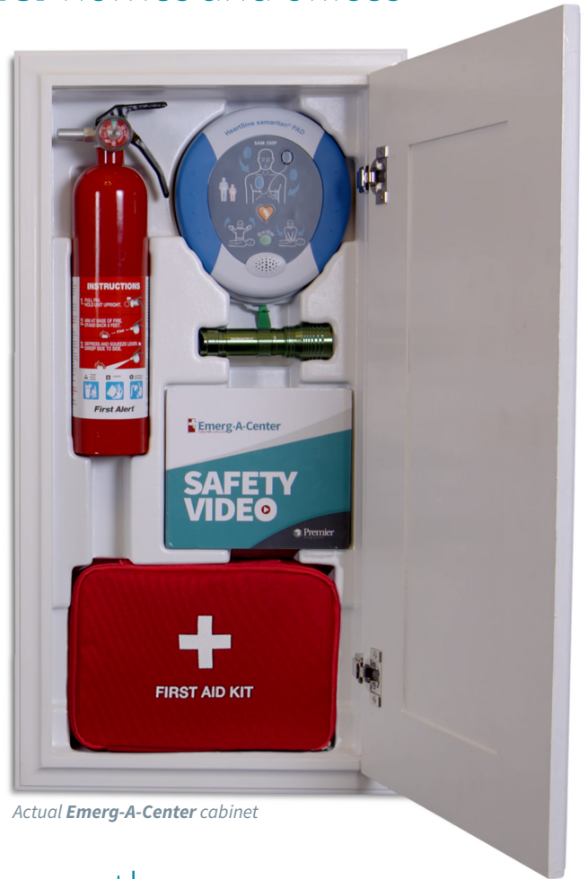
Actual Emerg-A-Center cabinet

Homes and offices are the second and third most dangerous places behind the highway Source : U.S. News & World Report