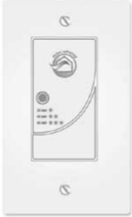
PUSH-BUTTON TIMER 20 /40 /60 minutes

The HRT-3 allows high speed ventilation for 20, 40 or 60 minutes