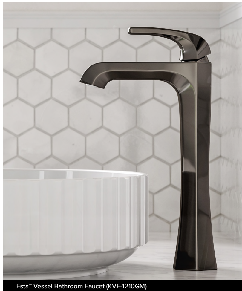
Esta™ Vessel Bathroom Faucet (KVF-1210GM)