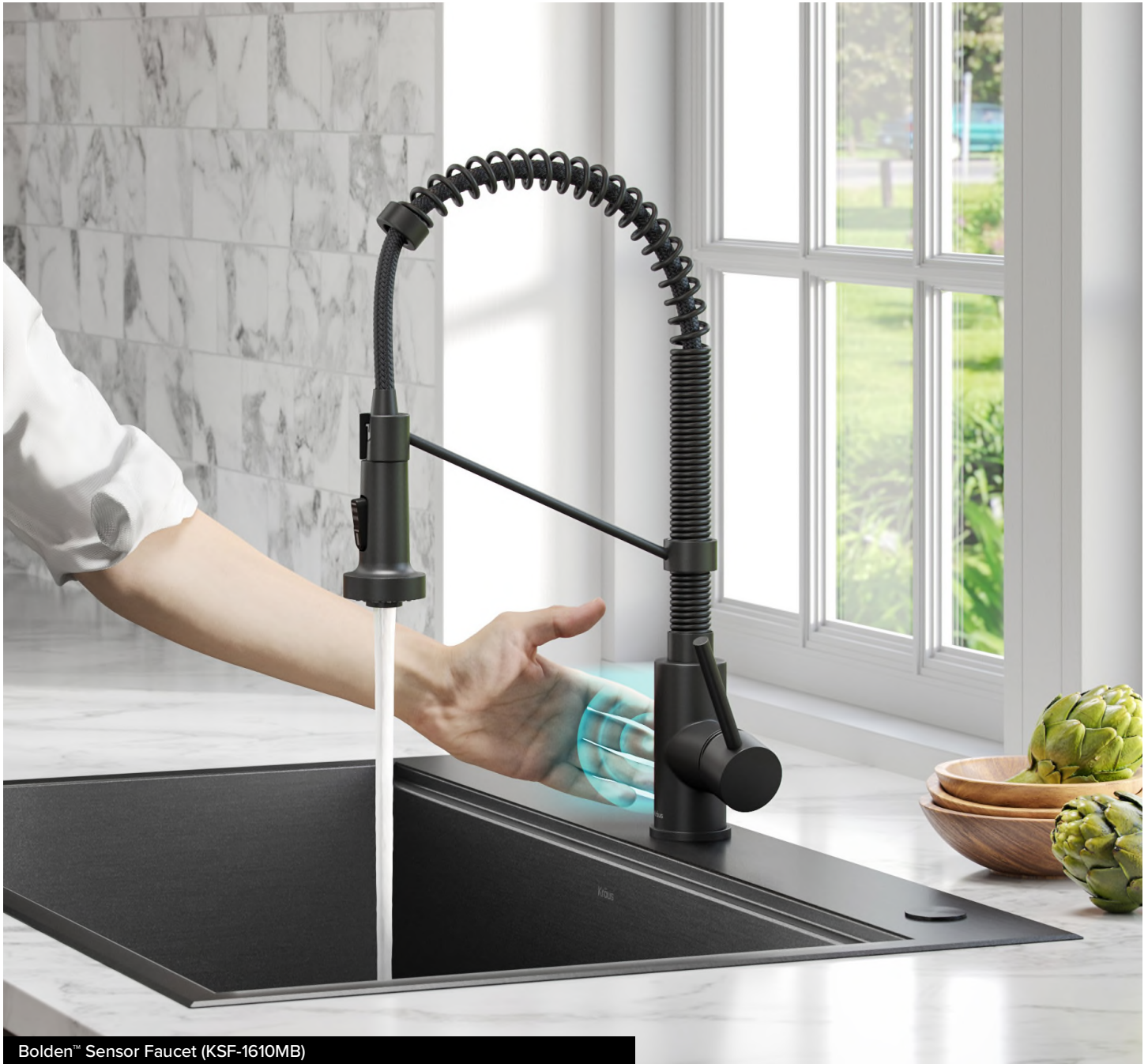
Bolden™ Sensor Faucet (KSF-1610MB)

Kraus Sensor Faucets are designed with hands-free capabilities, so they stay cleaner longer, with fewer spots and finger smudges over time. To clean and maintain your sensor faucet, simply follow the care instructions for Kraus Kitchen Faucets (Spot-Free Finishes or All Other Finishes), and enjoy the added benefit of ultra-clean hands-free functionality.