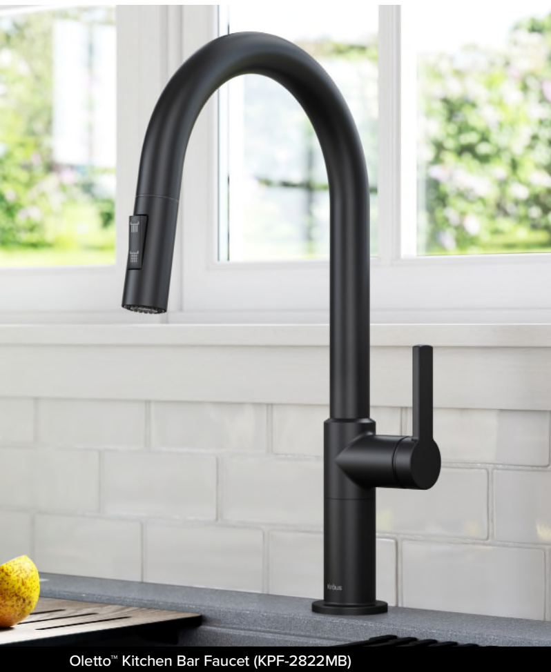
Oletto™ Kitchen Bar Faucet (KPF-2822MB)