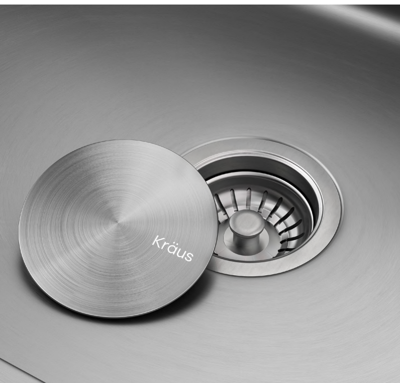
CapPro™ Removable Decorative Drain Cover (STC-2)