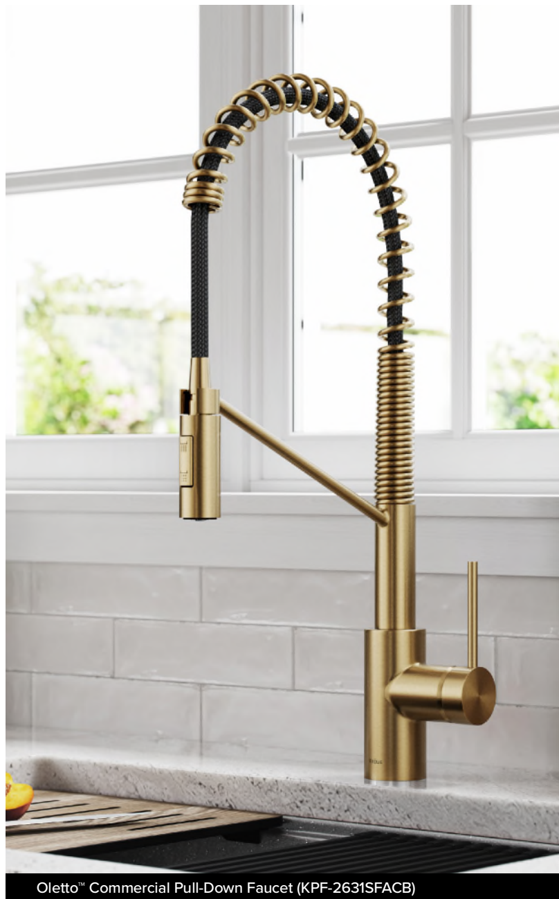
Oletto™ Commercial Pull-Down Faucet (KPF-2631SFACB)