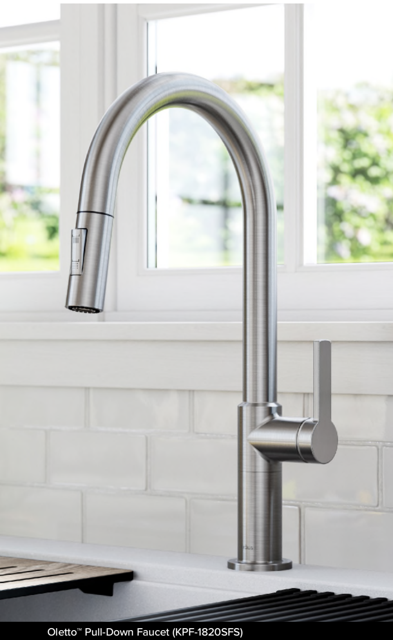
Oletto™ Pull-Down Faucet (KPF-1820SFS)

Keep your faucet looking newer longer with Spot-Free all-Brite™, a finish that requires less cleaning and shines longer by resisting water spots, fading, and fingerprints. For general maintenance of all-Brite™ faucets, we recommend cleaning your faucet with mild soap, rinsing thoroughly with warm water, and drying with a clean, soft cloth.