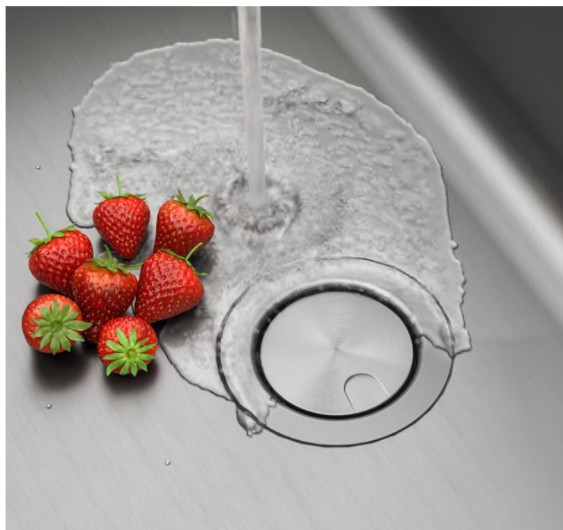
Stainless Steel Drain Assembly with Strainer (ST-4)