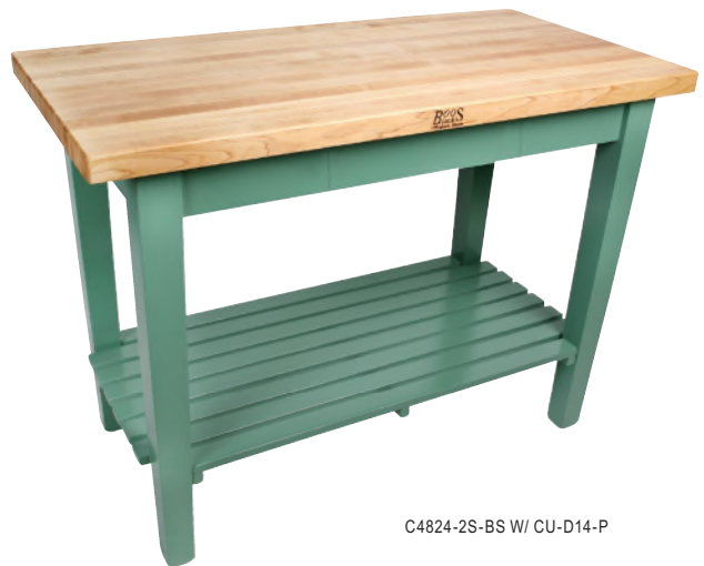
C4824-2S-BS W/ CU-D14-P