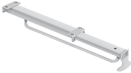
KV1 Sliding Clothing Carrier