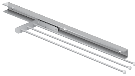
P793 Sliding Towel Bar